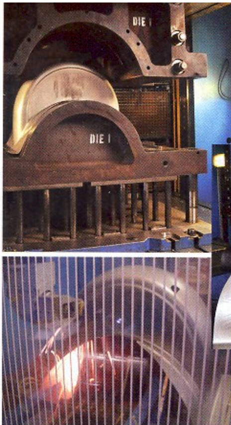
Type 304L stainless-steel blanks, 20 gauge, are deep drawn in an 850-ton AP&T hydraulic press, then laser-trimmed in a five-axis Prima cutting machine before undergoing a final restrike in a 1000-ton hydraulic press.

"We have to use a relatively high cushion force of 300 tons," Snyder says, "probably 2.5 times what we'd use for a mild-steel blank of this size. We also use a larger-than-typical blank in order to keep the shock lines off of the Class A surface. To minimize oil canning and manage the residual stresses building up